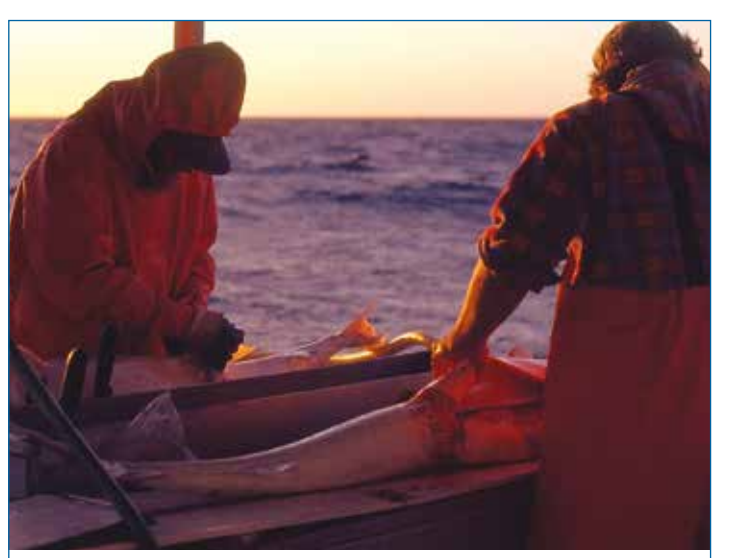
A commercial shark boat.

While some unethical and potentially unsustainable shark fishing practices are practiced in some parts of the world, WA's shark fisheries are strictly managed. Specific controls on fishing effort are continually adjusted in response to ongoing monitoring and assessment to ensure that shark fishing remains sustainable.