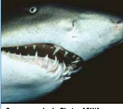
Grey nurse shark.

Large sharks are often the upper level or top predators within an ecosystem and help to control prey populations. They also remove weak