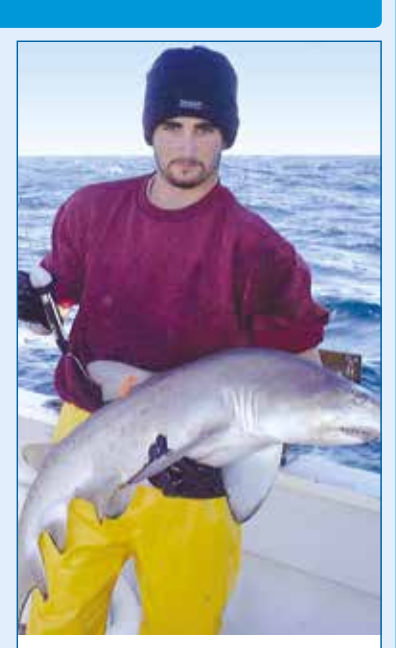
A grey nurse shark tagged with a device to record temperature, depth, light and location.

The researchers also study shark growth rates using cross-sections of vertebrae, their reproductive biology, different shark movements and use of different habitats through tagging studies, genetic identification of shark stocks, and the efficiency of different gear types used to catch sharks.