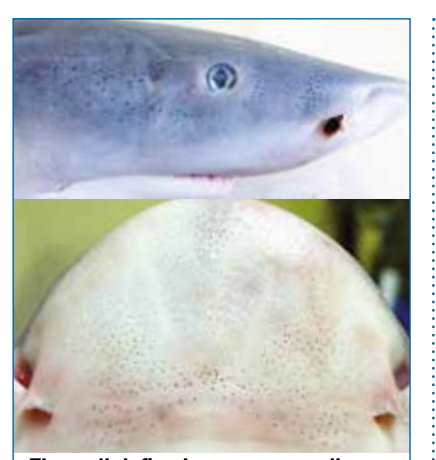
The well-defined sensory ampullae on the head of this northern river shark help it to hunt in muddy tidal creeks.

Sharks also have the ability to detect the