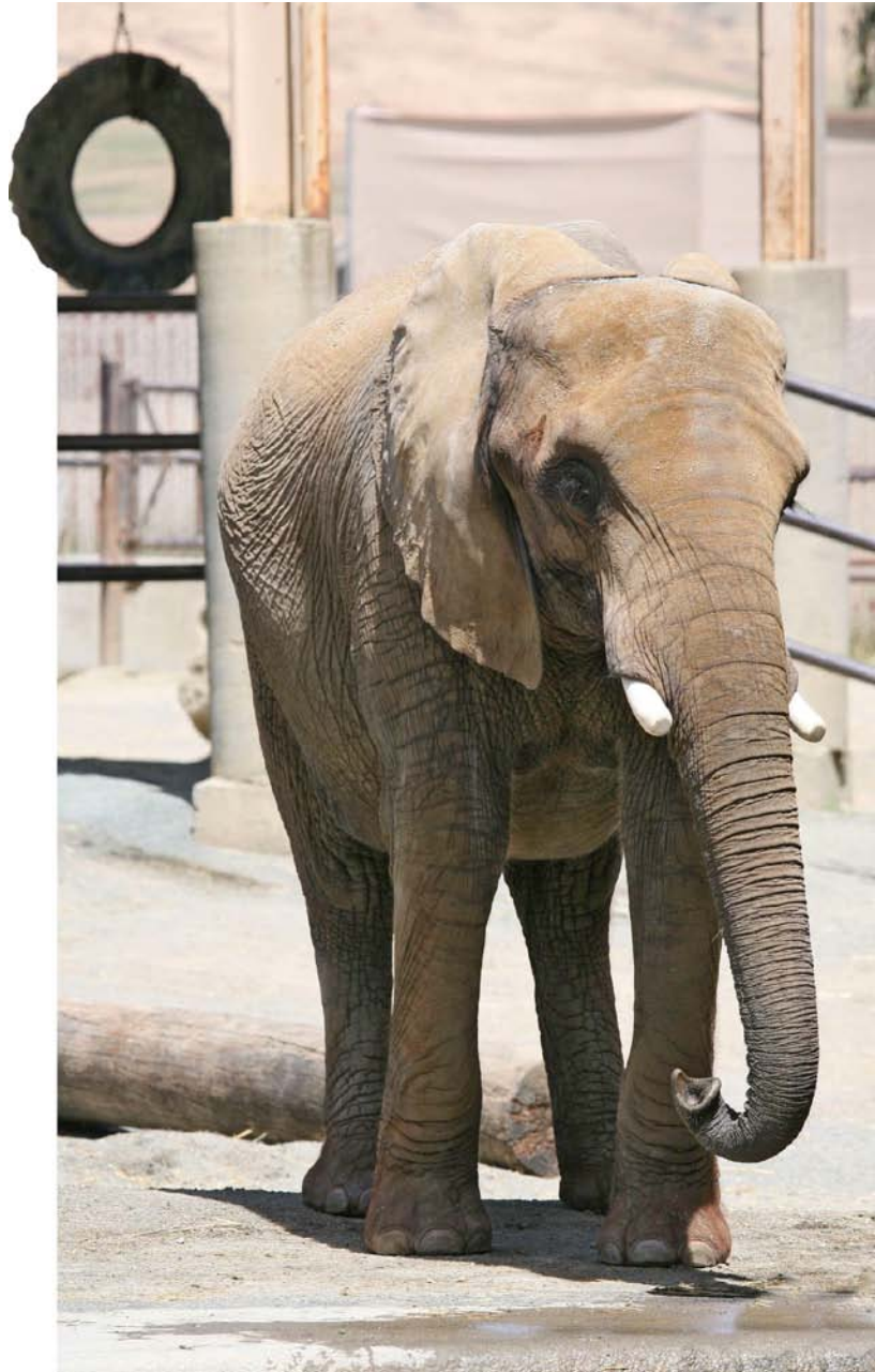
Some studies have shown that captive elephants live much shorter lives than wild ones.