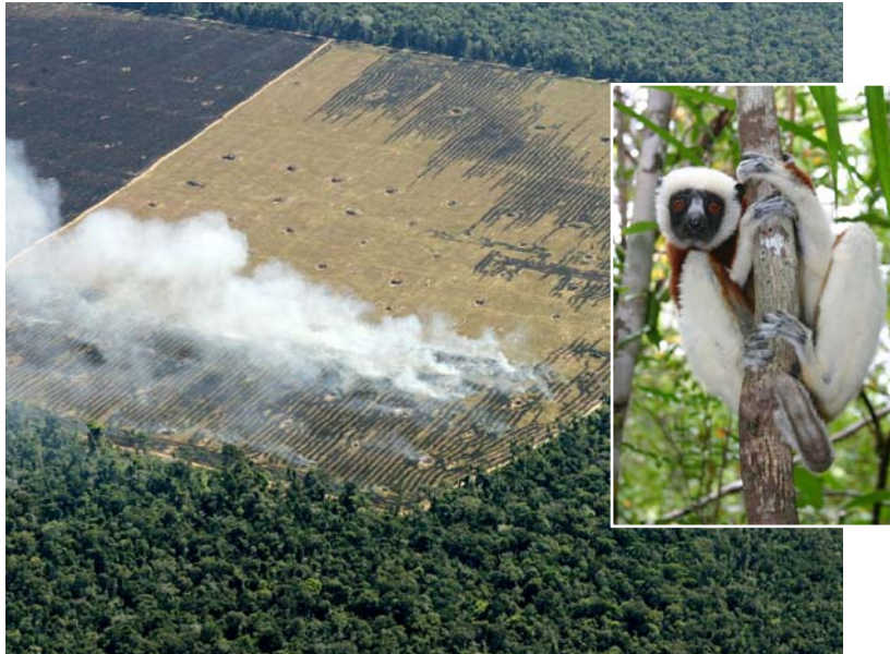
People's intentional destruction of animal habitats pushes many species beyond their ability to survive.

As people use more wild land for gathering resources and for farming, the natural habitats of animals are broken into smaller, disconnected areas. This process separates animals from others of their kind and makes it more difficult for them to find mates.