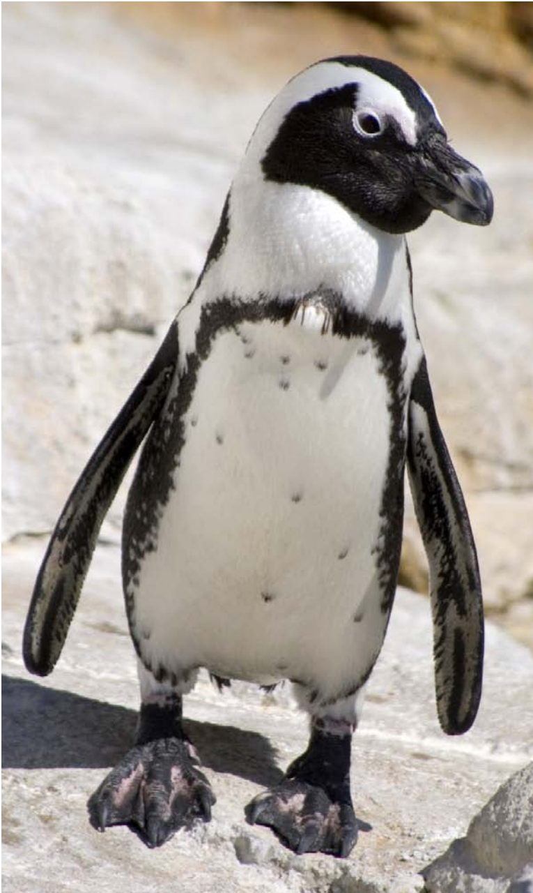
This penguin might have more room to swim and play if its zoo was expanded.