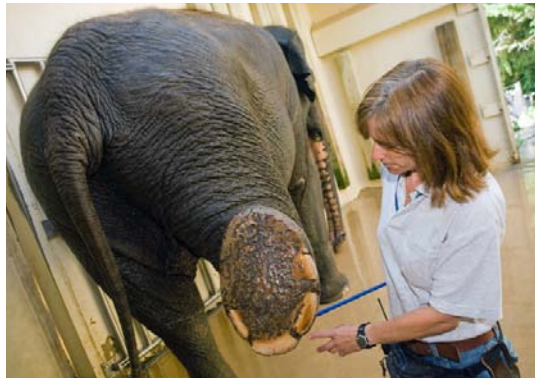
A zoo worker inspects an elephant's foot for signs of disease.

The focus of some zoos is on entertaining people, not on meeting the full range of needs of the animals. The life spans of some captive wild animals are shortened, and many of them can develop long-term health problems. For example, captive elephants suffer from a variety of physical conditions, such as arthritis and foot diseases, as well as psychological problems.