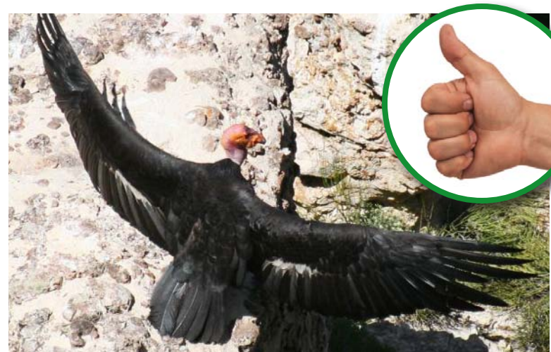
The combined efforts of the Los Angeles and San Diego Zoos saved the California condor from extinction.

I enthusiastically support the expansion of the Springfield Zoo. In recent decades, people have become more aware of the dangers facing Earth's environment. People are changing the natural world in ways that threaten many animal species. Many kinds of animals that have lived in balance on our planet for millions of years are now in danger of becoming extinct . It is up to us to fix the problems we have caused by cleaning up the environment, shifting to "greener" lifestyles, and making every effort to save species whose lives are threatened by our activities.