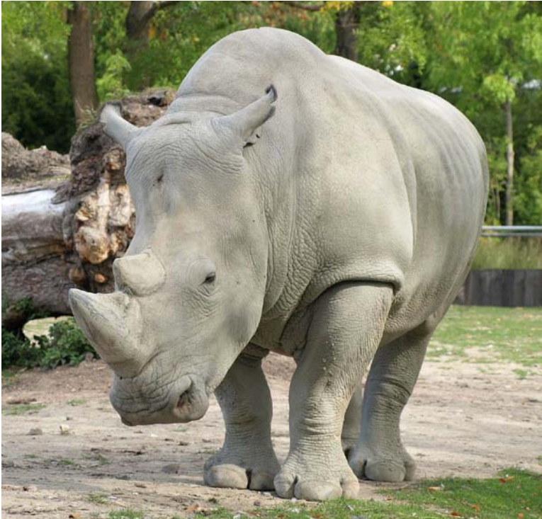
Rhinos are intelligent animals that can quickly become bored in captivity.

How would you feel if this happened to you? It's no different for the animals we capture and force to live in zoos.