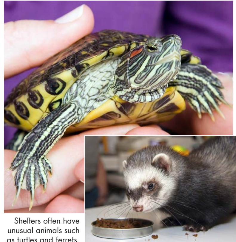
Shelters often have unusual animals such as turtles and ferrets.

When you think of an animal shelter, you probably think of cats and dogs. But shelters are home to many other kinds of animals, too. Shelters often have rabbits, birds, guinea pigs, ferrets, and turtles available for adoption, as well as cats and dogs.