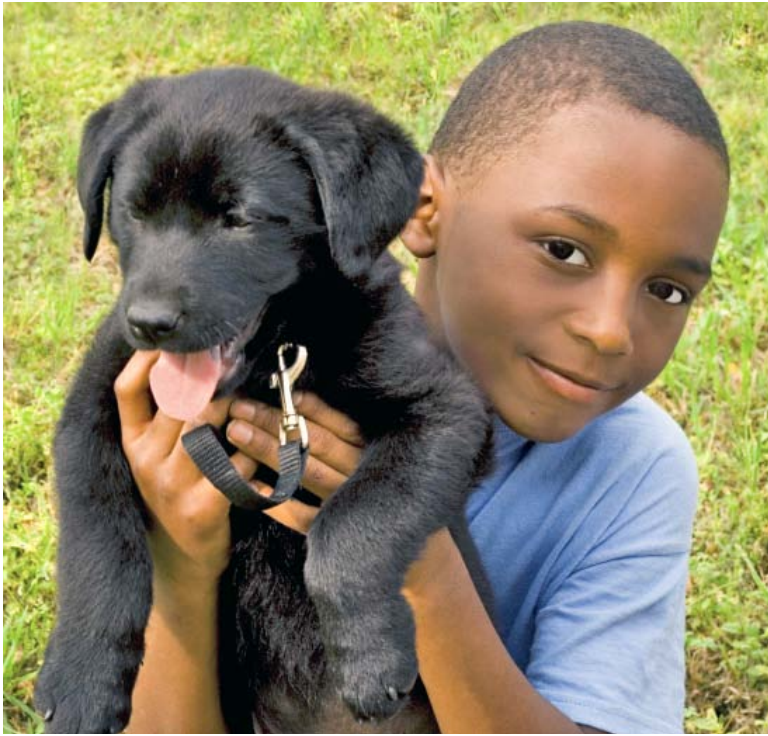
A shelter animal can make a good friend.