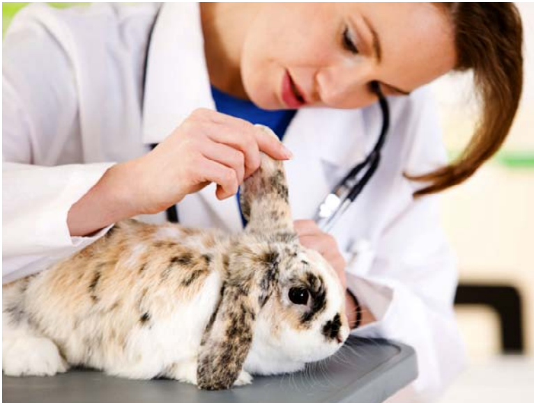
A vet checks the ear of a rabbit.

All shelter animals are checked by a veterinarian , or vet. The vet gives the animals shots to help them stay healthy.