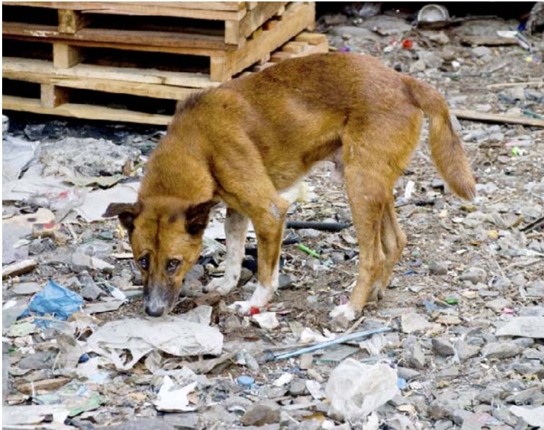
A stray dog looks for food in street trash.