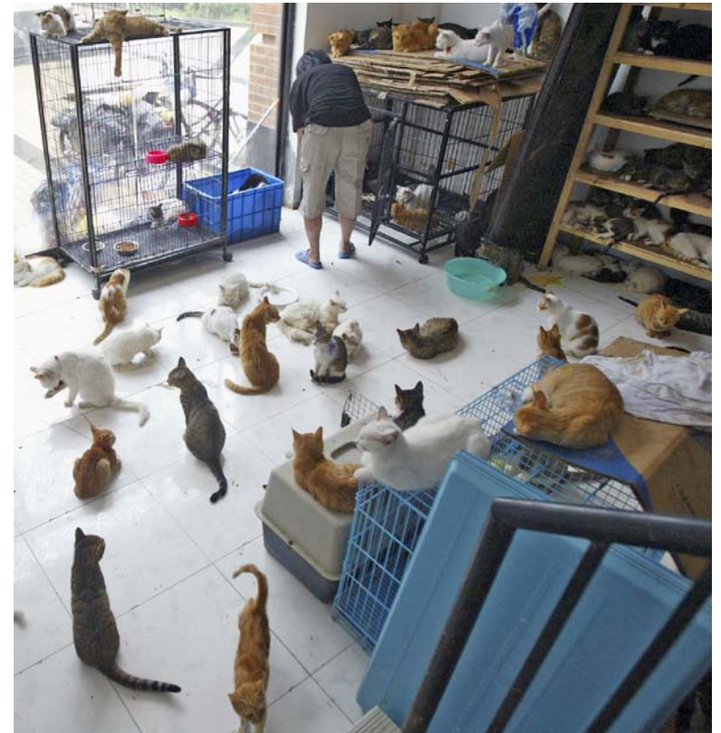
Rescued cats crowd a small shelter.

Buzz and Michelangelo are just two of more than six million animals living at shelters in the United States. Pets like Buzz and Michelangelo end up at shelters because there are not enough good homes for them. If your family is looking for a new pet, you should adopt one from a shelter.