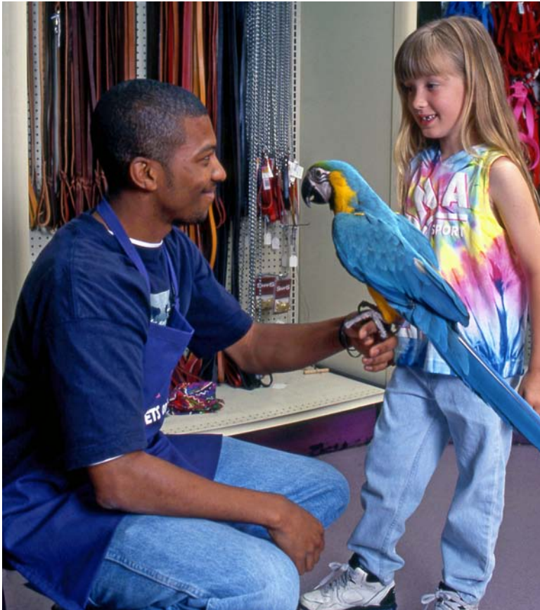
A pet store may not be the right place to look for a new pet.

A pet-store worker can't always help you decide which kind of pet is best for you. The worker may not have the time or experience to help you choose the right pet. He or she might not know the right questions to ask to help you pick a pet that fits your lifestyle .