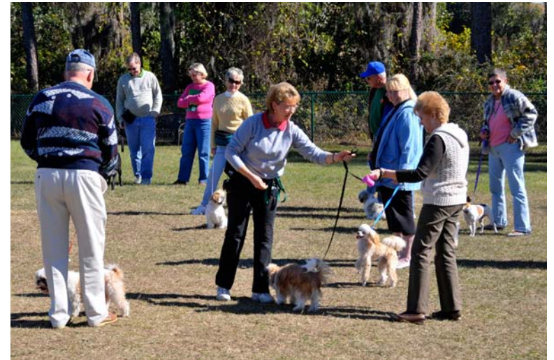
An instructor works with dogs and owners in an obedience-training class.

After choosing the right pet, a family pays the shelter a fee. The money helps pay for services to keep the pet healthy and happy. Included are the visit to a vet, obedience training , and an operation to keep the animal from having babies. The pet may also have a microchip placed under its skin. If the pet becomes lost, the microchip can help someone find the owner. These services are even more reasons to adopt your pet from a shelter.