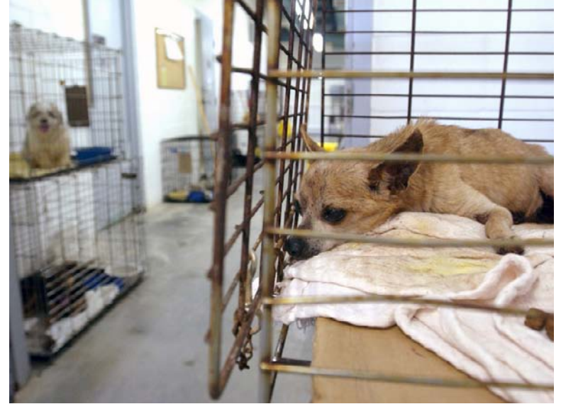
A Chihuahua waits for possible adoption.

Michelangelo is a shy two-year-old Siamese cat with pretty blue eyes. His owner couldn't take care of him, so he is at the same shelter.