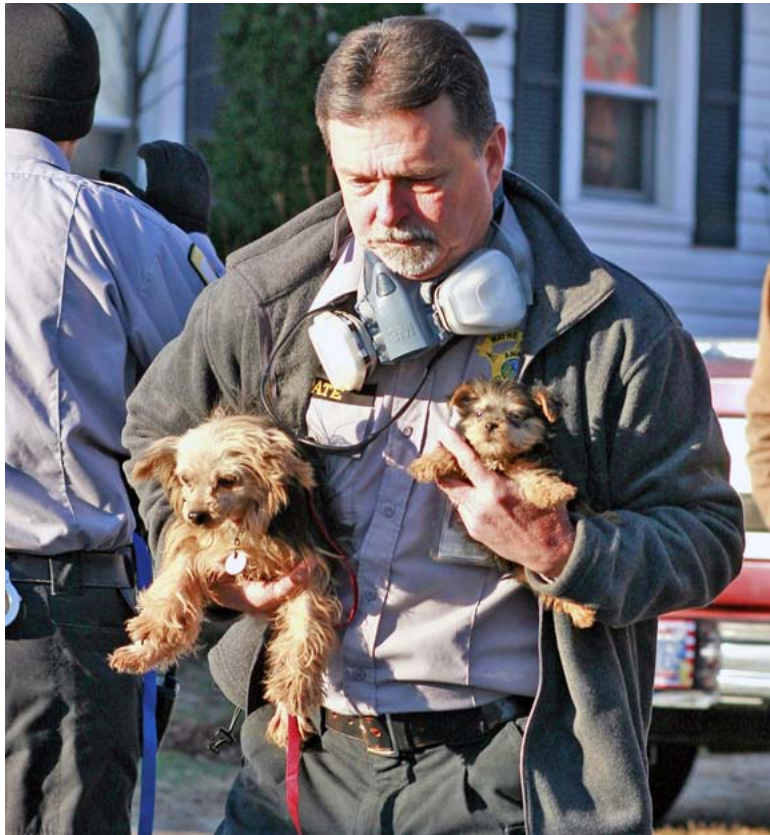
An animal-rescue worker assists with the removal of about three hundred dogs from a suspected puppy mill.

Sometimes, puppies for sale at pet stores or breeders come from puppy mills . A puppy mill is a breeding business that does not take good care of its animals. Animals from a pet store or breeder can also be expensive, sometimes costing thousands of dollars.