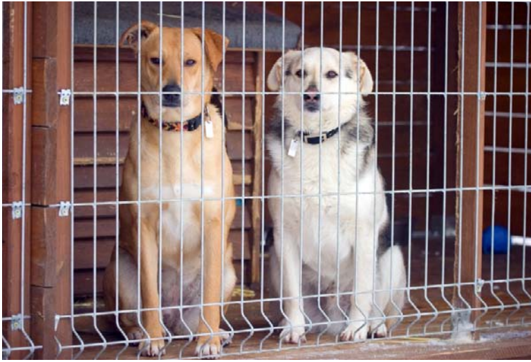
Dogs wait for adoption at an animal shelter.