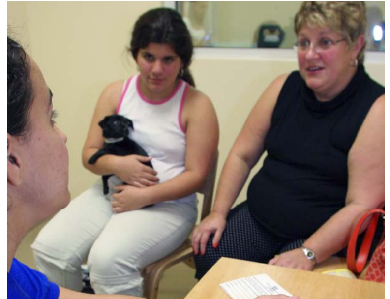
A counselor talks with a puppy's new family.